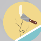
SEAL UP CRACKS & GAPS