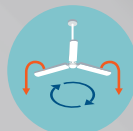
CLOCKWISE CEILING FAN DIRECTION