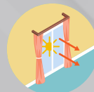
LET THE SUN SHINE IN DURING THE DAY