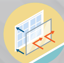
INSULATE DOORS & WINDOWS